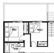
UPPER FLOOR PLAN UPPER FLOOR AREA: 349 SQ. FT. 2 BEDROOMS | 1.5 BATHS 949 SQUARE FEET