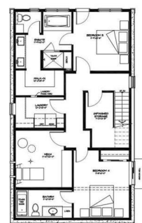
LOWER FLOOR PLAN (optional) DEVELOPED LOWER: 850 SQ. FT.

The Developer reserves the right to make modifications or substitutions to building design, specifications and floorplans to maintain the high standards of this project. Square footages are based on preliminary architectural measurements and may be subject to change. E & O.E.