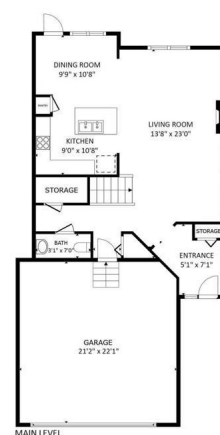
119 Cimarron Vista Crescent - Okotoks MAIN LEVEL: 813.5 SqFt, GARAGE: 491.5 SqFt